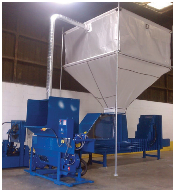
Foam PS Densification Machine With Hopper

The hopper should have an electric conveyor on the bottom. If space is tight, consider placing the bunker/hopper under the existing conveyors/catwalks.