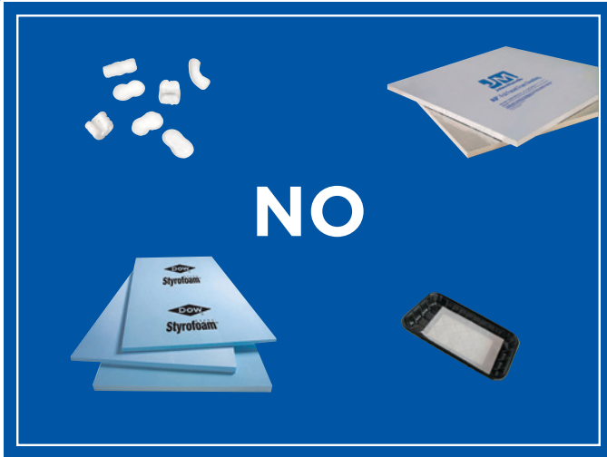
Examples of Foam PS Not Typically Accepted.